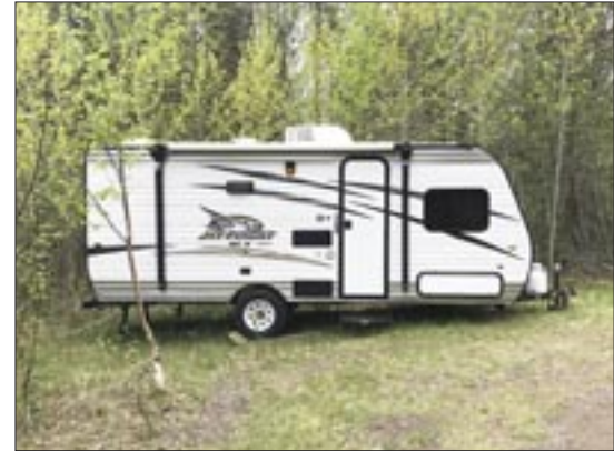
Sugarloaf Cove staff housing

Another addition to the Cove is a new staff trailer. For the past 5 years, Margie has lived in a pop-up trailer in the woods behind the building. Before that she lived in a tent! This spring we upgraded her to a nice camper that you will see parked along the road to the building. Thank you to the board and donors for their continuing support of our staff. If you would like to contribute to our staff housing fund, please contact Molly at 218-525-0001. Thanks!