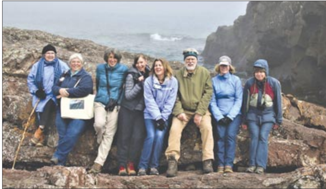
The 2019 Sugarloaf Cove Master Naturalist class – a vital source of Sugarloaf volunteers.

Sugarloaf Cove’s mission to “preserve and restore the North Shore’s unique environment through education and exemplary stewardship” is successful because of our many nature lover volunteers. There are countless opportunities to bring your inner nature enthusiast to life.