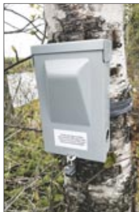
A pedestrian counter at Sugarloaf Cove