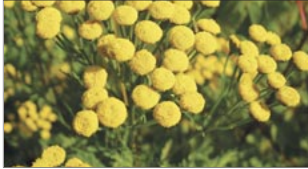
Common tansy ( Tanacetum vulgare )

Course fee: $10 per person / $8 for Sugarloaf members. Payment will be taken on the day of the training. (Cash or check ONLY).