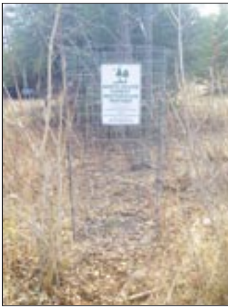
Watch for these signs as you travel up the North Shore.

Sugarloaf is a founding member and fiscal agent of The North Shore Forest Collaborative (NSFC). NSFC is a coordinated effort between local, state, and federal land management agencies as well as public and private organizations and individuals who want to work together to assure a healthy forest environment. Working together with the NSFC, Sugarloaf is able to reach more landowners and make a bigger impact along the North Shore. Everyone is invited to attend the general meetings and workshops. Visit northshoreforest.org .