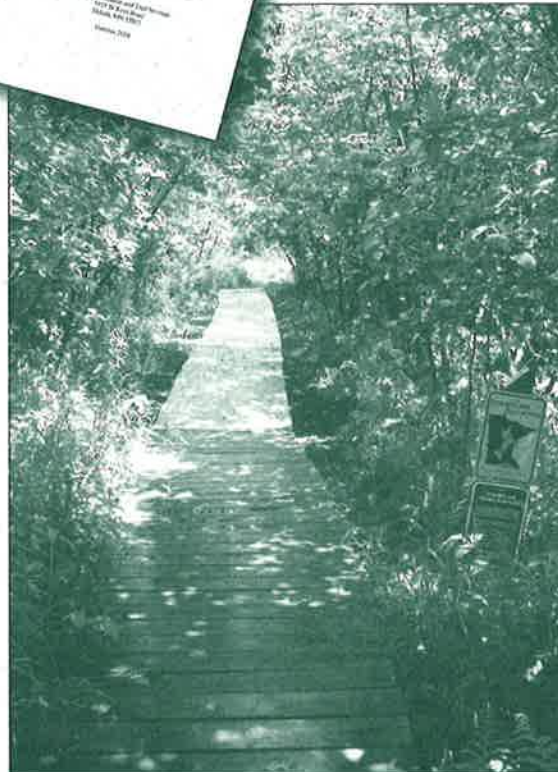
New boardwalk segment in SNA built by MCC crew, summer 2008