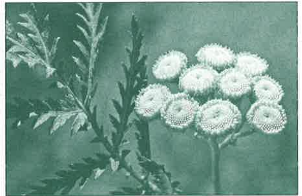
Common Tansy ( Tanacetum vulgare )

landowners, and managers. Additionally, volunteers will be trained to use GPS units to record the location of select invasive plant species and to document them through photographs. This information will be downloaded into Google Earth and will be readily available for use by county