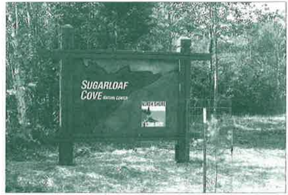
New entrance sign at Sugarloaf Cove

Unfortunately, our sign is 100 feet from the road due to Minnesota Department of