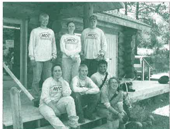
One of the MCC crews that placed gravel along our trail.

Transportation (MNDOT) right-of-way restrictions. As noted by many visitors, the sign is not visible from Highway 61. Sugarloaf is working with MNDOT to find a way to have the sign moved closer to the road, hopefully by next summer.