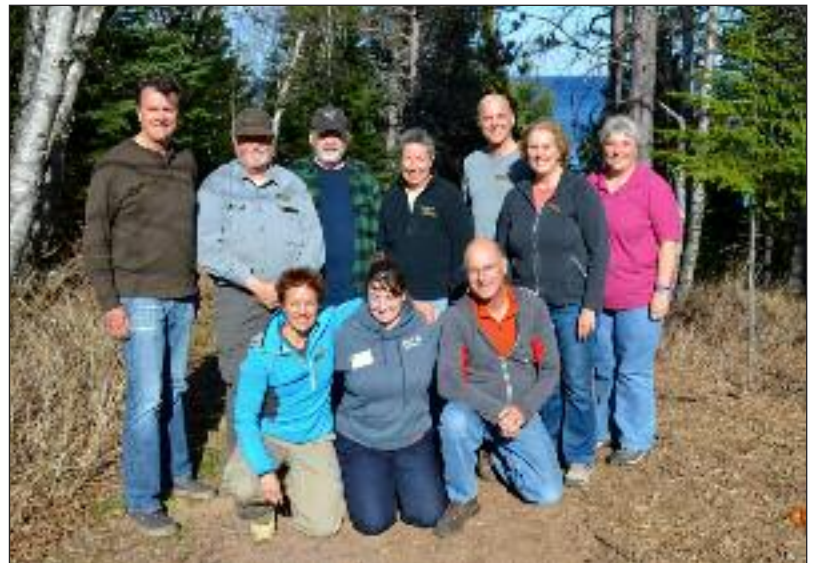
Master Naturalist class of 2016

The Master Naturalist program is a joint effort of the University of Minnesota Extension Service and the Minnesota Department of Natural Resources. This specific Master Naturalist Program focused on the boreal forest/Great Lakes biome. The course consists of six full Saturdays of formal presentations, field trips, and informal discussions. Guest lecturers facilitated “nature geek” enthusiasm for seagulls, ferns and other delightful topics, which were also open to the public and