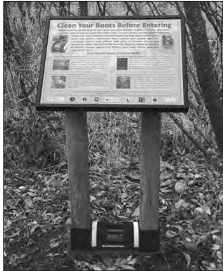
New boot brush invasive species sign at Sugarloaf's northeast trailhead.

The Cook County Community Fund, the Carl and Verna Schmidt Foundation and Loll Designs (through 1% for the Planet) provided us grants for summer programming and advertising.