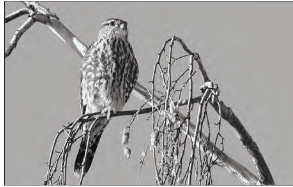
"Merlin"

Summer of 2011 whirled by way too quickly as summers always seem to do. It was a cool and soggy start for the nesting birds with a good portion of late May and June rainy and wet. We had a resident pair of Merlins (A species of falcons) who made their