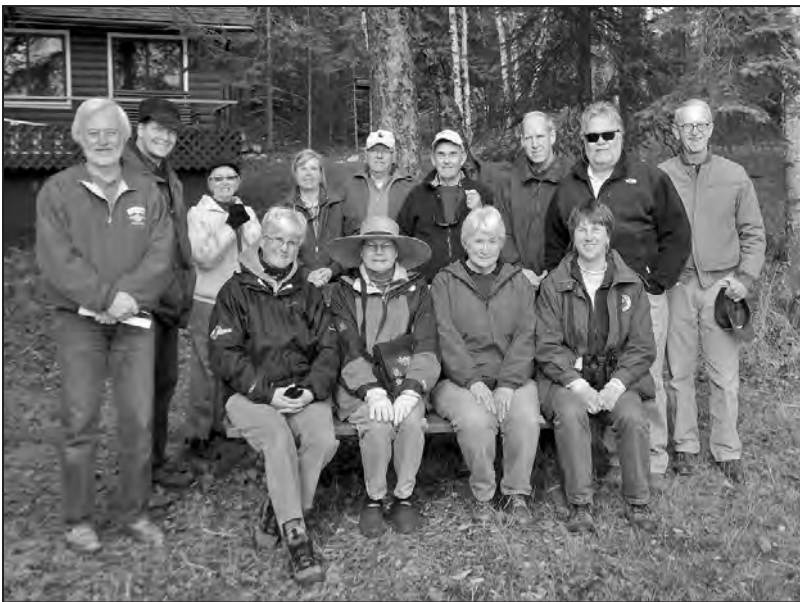
Sugarloaf's Lost Forest program is a vital part of meeting our stewardship mission. Pictured above is our 2011/2012 Lost Forest participants.

We have been working hard to provide educational programs that are exciting and relevant to North Shore residents and visitors. This summer we are planning to add a movie night featuring nature and environmental issues films. To make attending our programs more comfortable, we are purchasing new tables and chairs. And to store those tables and chairs, and other equipment, we are planning to add a storage room to the side of the building in the near future. We will need your help with these improvements. Watch for more information about how you can contribute toward these needed additions.